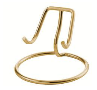
Stand for Tribute Heart