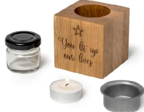
Wooden Eternity Candle Holder