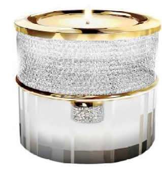
Tealight with Silver Rim Gold Rim Available in Blue, Green and Pink glass