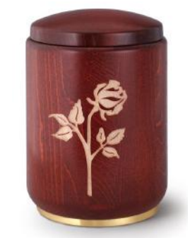
Stained Mahogany (W)